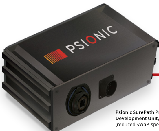
Psionic SurePath Processor Development Unit, Gen. 5 (reduced SWaP, specifications to come)

Psionic SurePath technology ensures precise navigation over long distances even when GPS or other external signals are not available or can not be trusted.